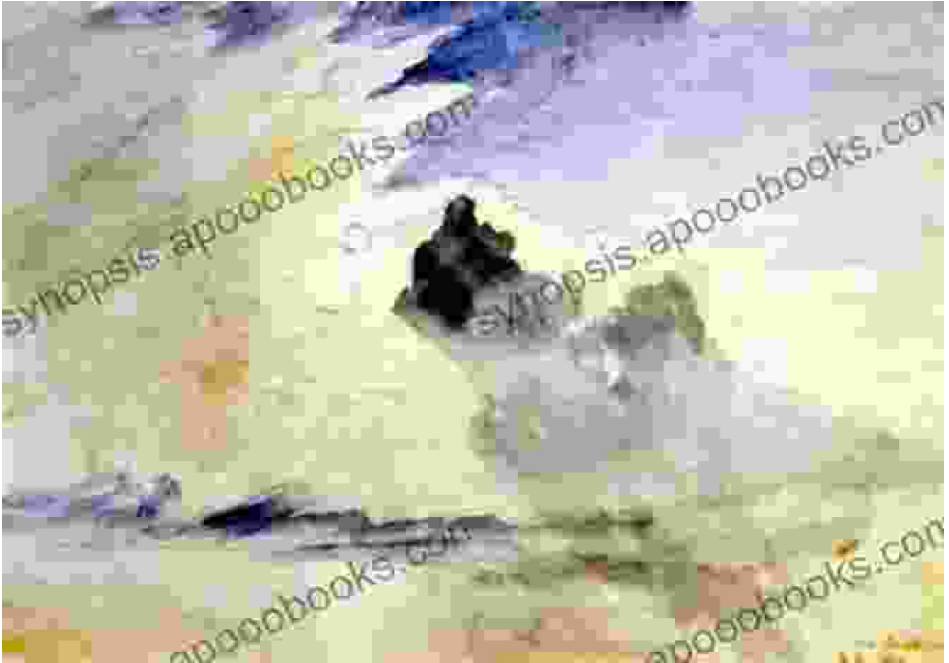
John Ruskin, Study of Clouds , 1842