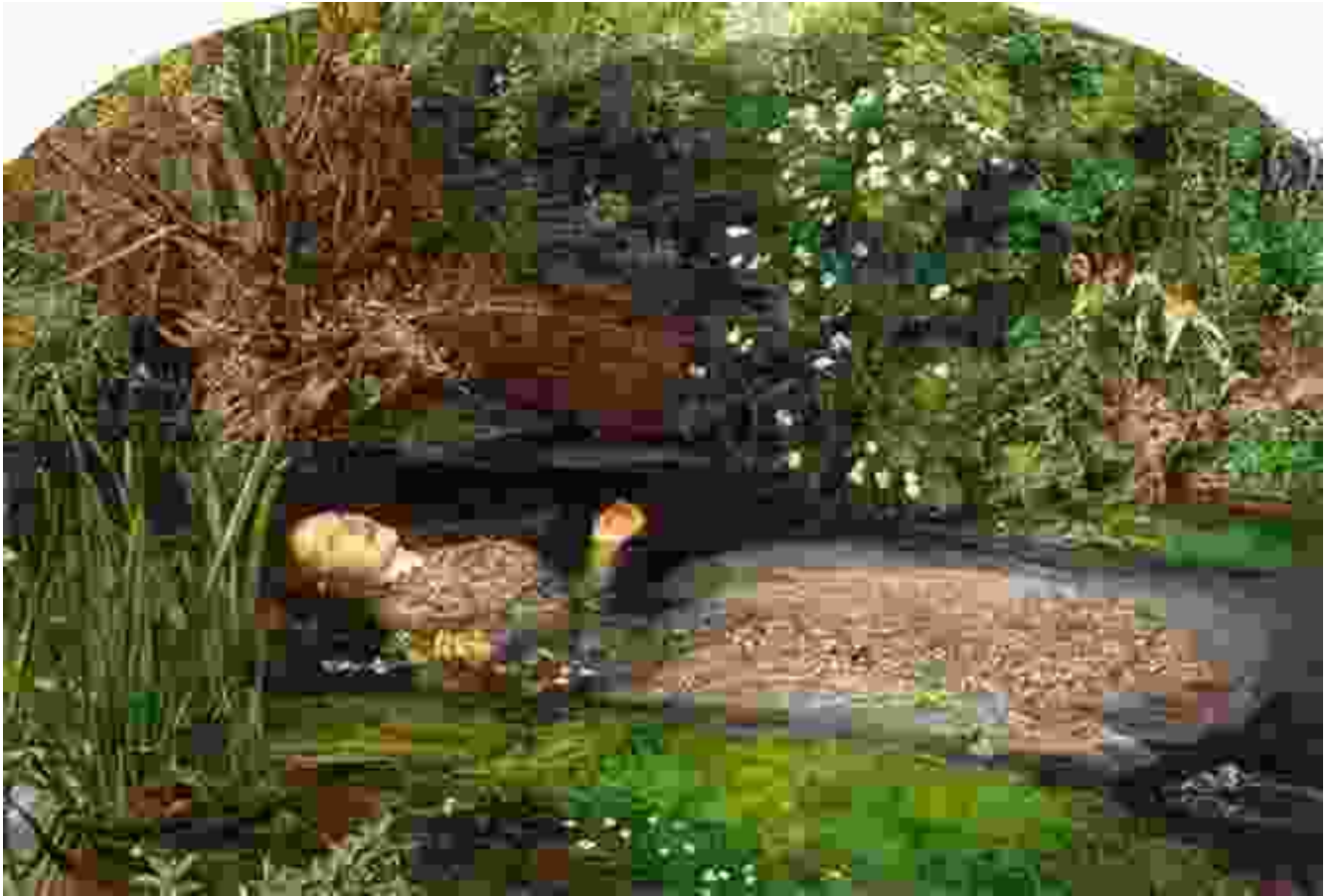
John Everett Millais, Ophelia , 1852